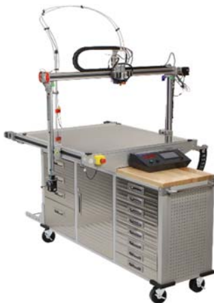
The Workbench Pro

More Value: Whether you are a business that seeks a rapid ROI, or an organization that requires low-cost entry into large-format 3D printing, 3D Platform has the solution. With prices starting at $14,999 and speed upgrades starting at $2,500, organizations and businesses can invest with confidence. With 3D Platform, you always know that both purchase price and operating costs are optimized. Customers can choose from a wide variety of open market filament and software that can deliver up to a 90% savings on investment.