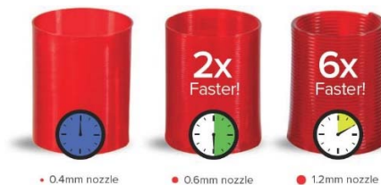
New extruder performance!